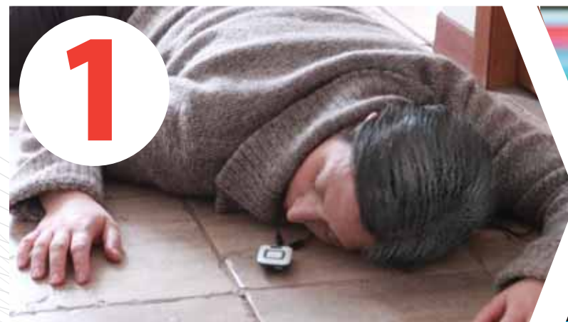
1 Help Call is Alerted