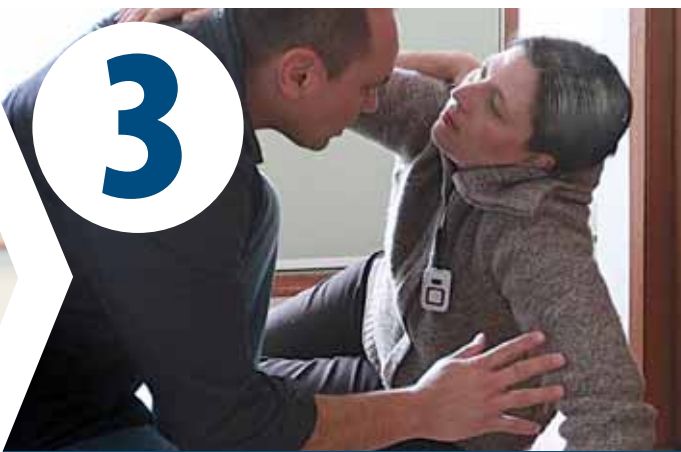
3 Help Arrives