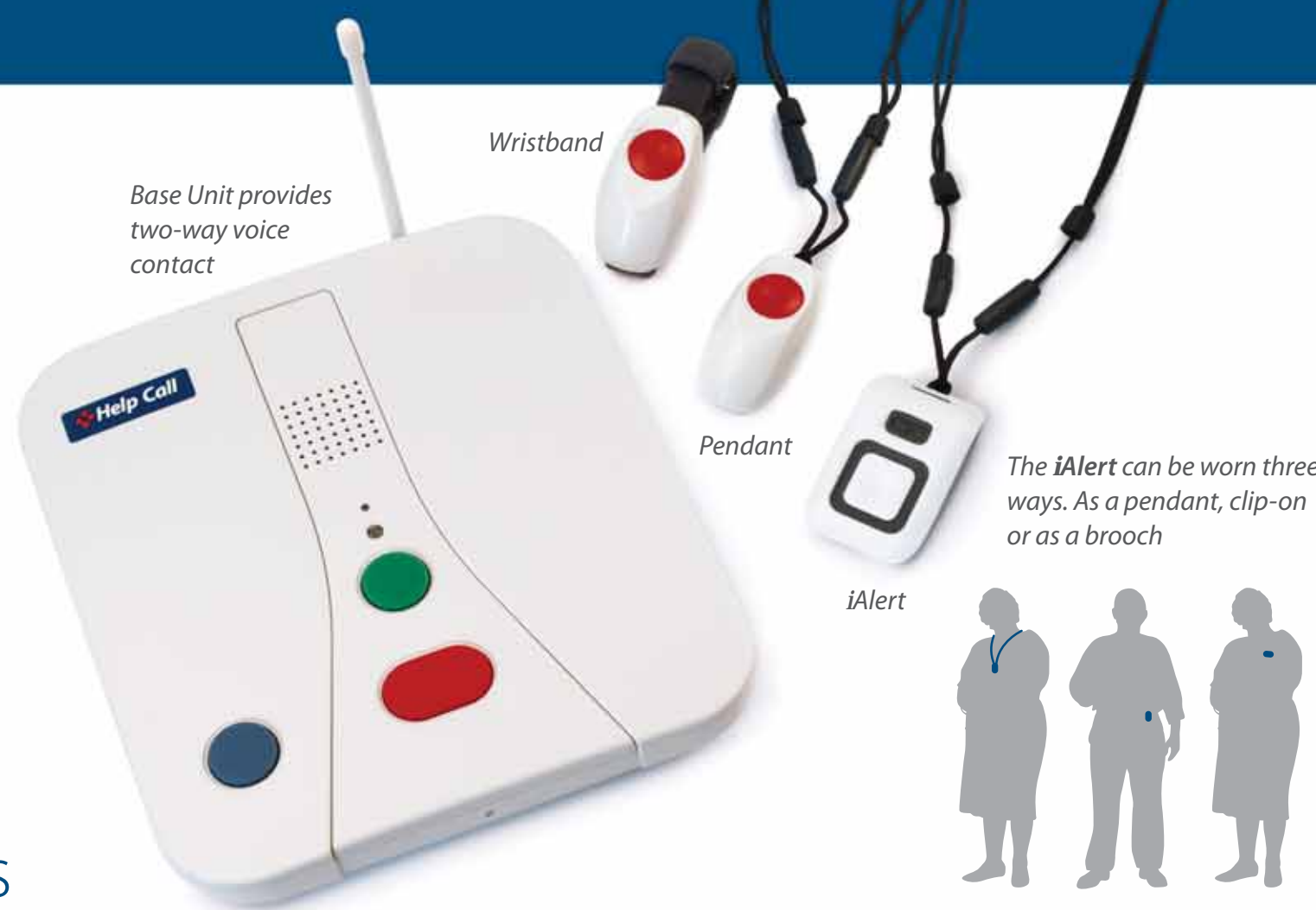
Base Unit provides two-way voice contact